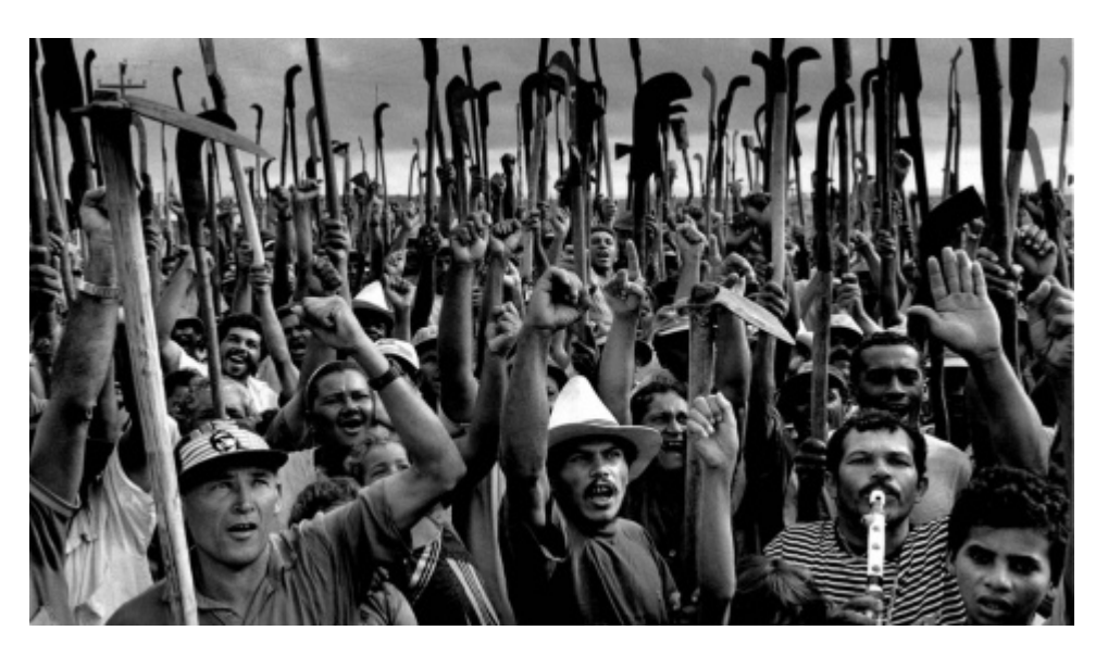
Movement of Millions Say No to Gene Drives as Brazil Attempts to Legalize